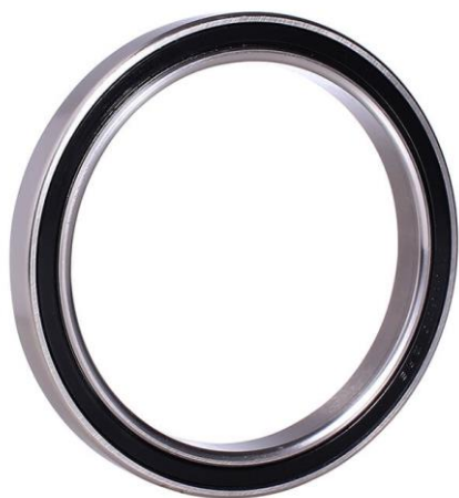
Thin section bearings sealed