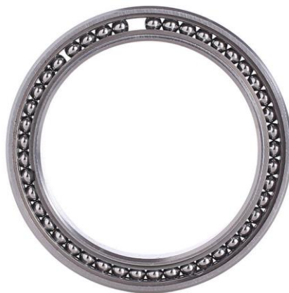
Full ball thin section bearing