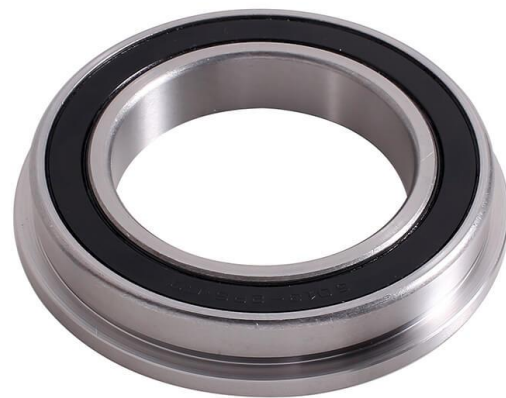
Flange type thin section bearing