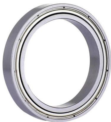
Thin section bearing with shields