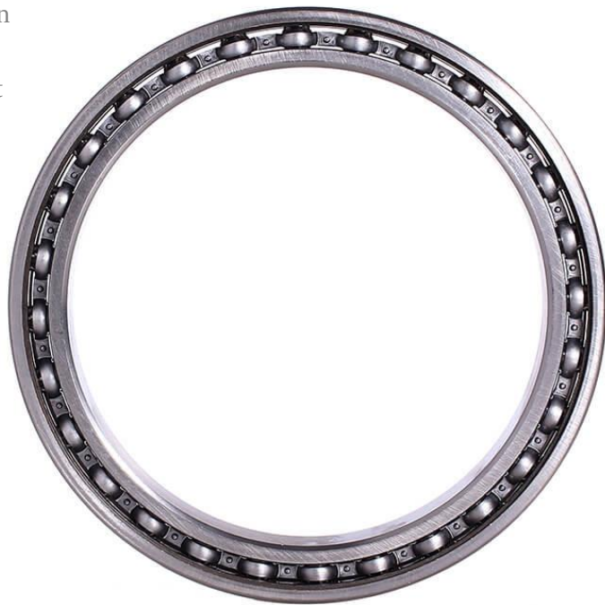
Thin section bearing open style

Material: Chrome steel/stainless steel/ceramic balls